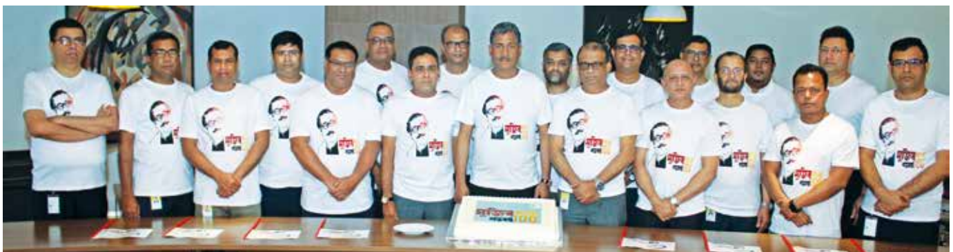
EBL Board of Directors and MANCOM members donned in Mujib Borsho T-shirt cut a cake to observe Birth Centenary of Father of the Nation