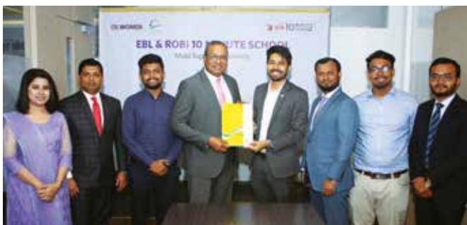
Signing with Robi 10 Minute School