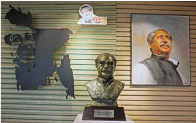
A bust and portrait of Bangabandhu displayed at Mujib Corner

One side of the corner features a bust and a portrait of Bangabandhu and on other side features photos on the life and works of the father of the nation. Mujib Corner at EBL head office is rich in books, pictures and documents on the life and works and ideals of the architect of our independence. The customers and the employees of EBL can spend time at the corner to read books and journals to learn about the life, struggle and ideals of Bangabandhu.