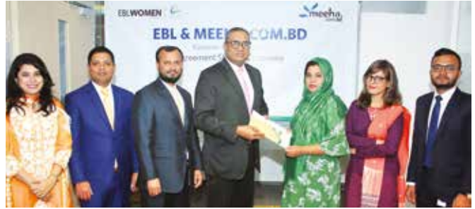
Signing with Meeha.com.bd