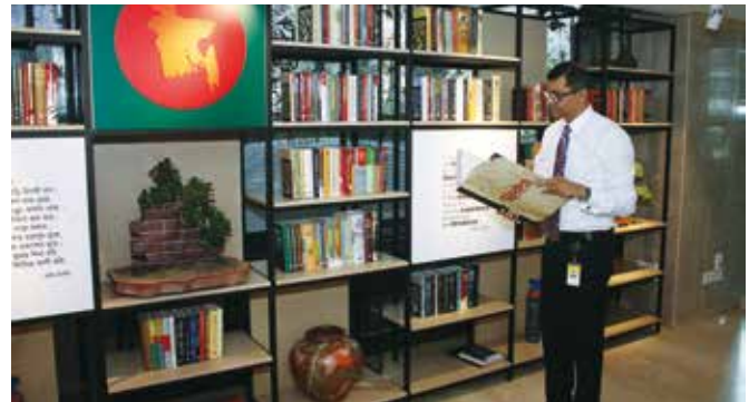
The Mujib Corner at EBL head office lobby, endowed with a rich collection of books and journals on life and works of Father of the Nation Bangabandhu Sheikh Mujibur Rahman, is drawing attention of readers and visitors.

All in all, a principled, socially responsive and ethical banking is what we aspire to achieve in all our deeds and banking activities and by doing so impact our society positively and sustainably.