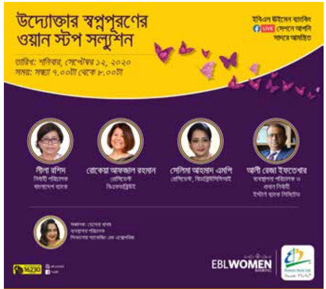
EBL Women Banking entrepreneurial booklet আমি নারী, আমি সফল

EBL Women Banking has introduced an entrepreneurial booklet exclusively covering different day to day business management issues in detail for entrepreneurs. It also covers issues like inventory management, addressing online customer's need, keeping transaction details, preparing a business loan request etc.