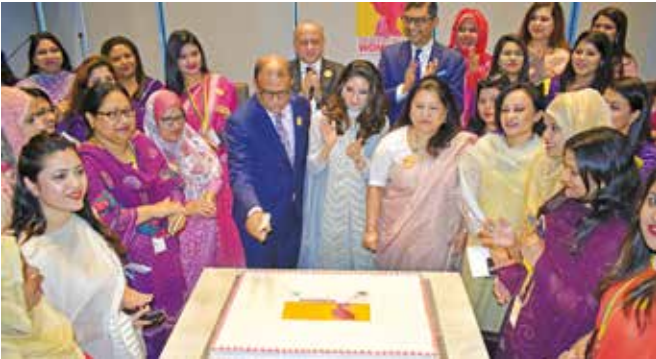
EBL Celebrates Womanhood at Head Office on 8th March, 2020

As a great believer of women empowerment, we have designed some special products for women entrepreneurs at special discounted loan pricing to provide growth support. Women clients can avail EBL Mukti loan up to BDT 25 Lac without any collateral and up to BDT 50 lac with collateral. EBL also guides women clients on various business issues such as financial record keeping/accounting, sales routing through bank account, trade license, taxation, marketing, insurance etc. Moreover every year we celebrate International Women's Day to celebrate womanhood while calling for greater equality.