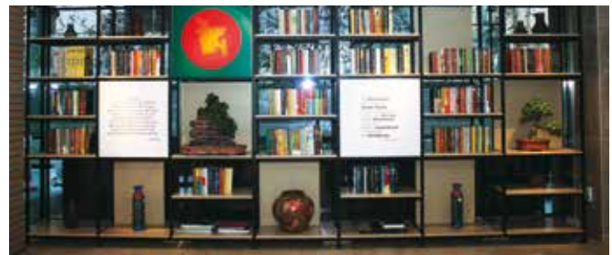
Well-organized bookshelf of Mujib Corner

All in all, a principled, socially responsive and ethical banking is what we aspire to achieve in all our deeds and banking activities and by doing so impact our society positively and sustainably.