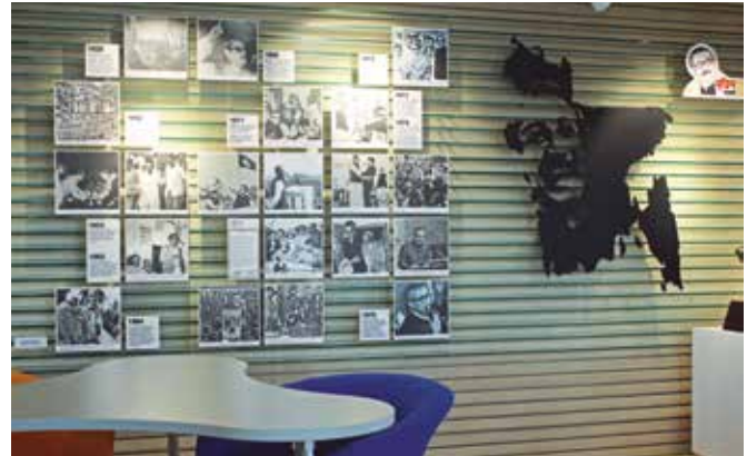
A photo collage on Bangabandhu's life and works