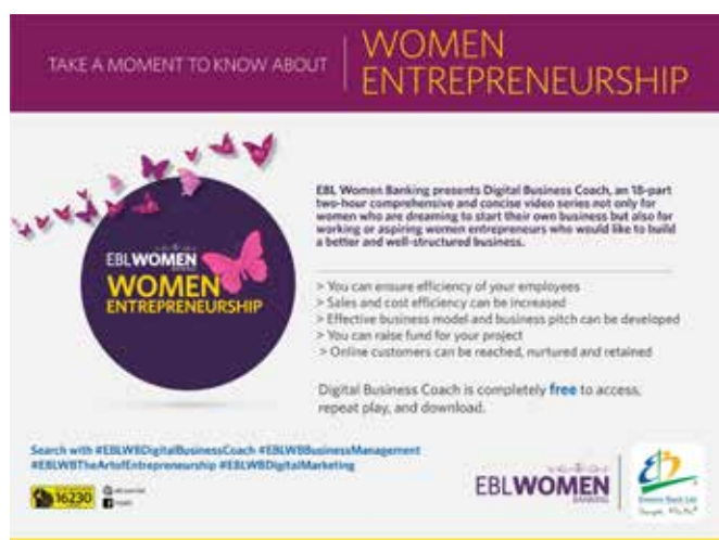
Digital Business Coach-Women Entrepreneurship