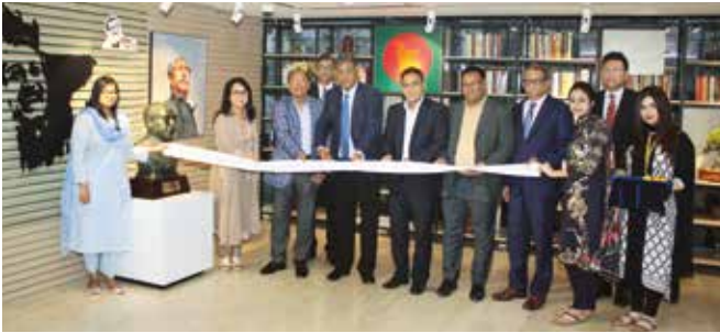
Inauguration of 'Mujib Corner' at the lobby area of EBL Head Office