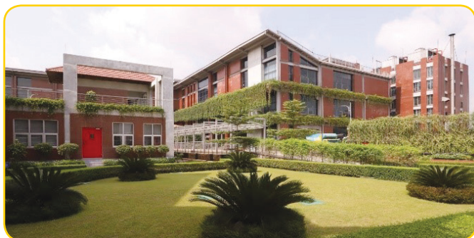
Environment friendly project financed by EBL

The Bank also ensures that customers having production facilities susceptible to damage environment has due environmental clearance certificate from the concerned ministry while granting or renewing credit facilities. EBL is the first bank in Bangladesh to offer sustainable energy finance loan product with assistance from the South Asia Enterprise Development Facility (SEDF), managed by IFC in partnership with the UK Department for International Development and the Norwegian Agency for Development Cooperation to help companies implement energy-saving measures and boosting the competitiveness of private enterprises.