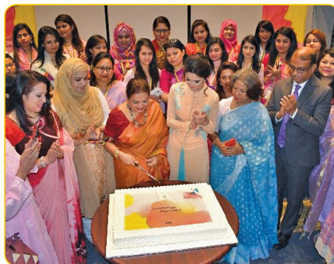
EBL Celebrates Womanhood at Head Office on 8th March, 2019