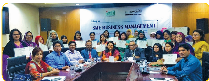
Women entrepreneurs at the SME business management training program

EBL Women Banking in association with SME Foundation arranged a 5-day comprehensive training program on SME business management for 30 women entrepreneurs. Through this training, women were taught the fundamentals of starting a business in an engaging and interactive manner, resulting in a complete business plan. They were also given enhanced training on credit management, database maintenance and monitoring business health. All trainees received certificates upon completion of the training from EBL.