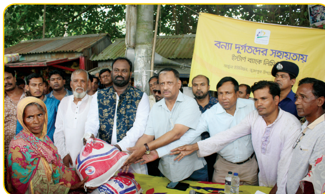
EBL distributes essential food and medicine among flood affected people of Tangail district.

Our corporate values tell us to stand by the people in need and reaching out to them in crisis. The society we belong to and operate is the place where all our responsibilities lie. We have always come forward with support. Our society is our first preference: be it distributing blankets to cold-hit people of the country, reaching out relief to flood-affected people and responding to any national emergency. EBL distributed food and medicine among the flood affected people of Tangail district.